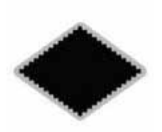
Cold Repair Patch Diamond EP160